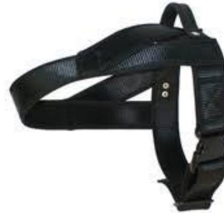
Actual Triple B Harness

Below is the chart of measurements which are required