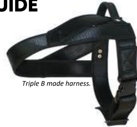
Triple B made harness.

Cart Design (standard) - 2 inch (50mm) seatbelt webbing with binding.